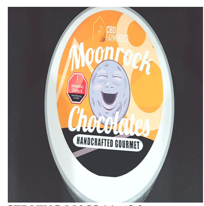
SERVING MASS (g): 13.0 SERVINGS/UNIT: 6

Moisture Content (%): -Water Activity (aw): -